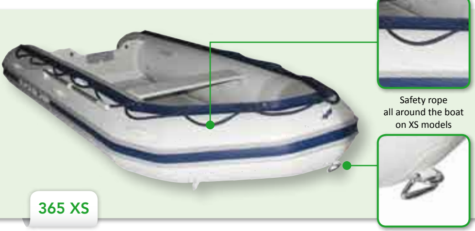
Stainless steel D ring