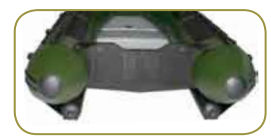
The 470 XS has a new hull which is shaped like a catamaran with 2 small tubes next to the main one. This model can be equipped with an engine up to 60 HP.

Especially designed to suit the needs of sea fishermen and scuba divers.