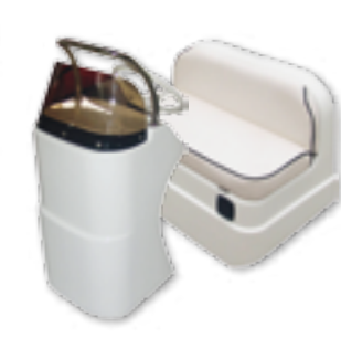
Pack Comfort Available on: 415 XS 470 XS